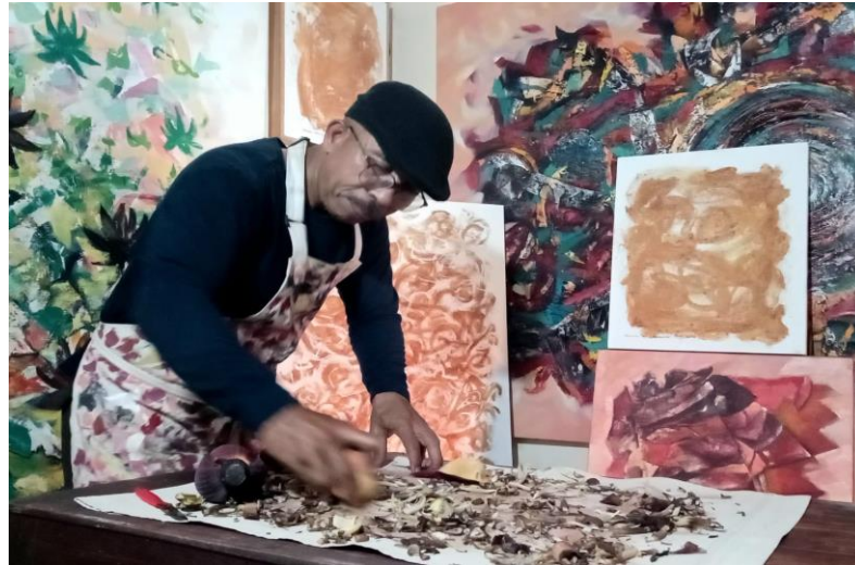
Figure 1. Painter: I Nengah Wirakesuma . Painting Process with Sap Banana Heart , Size: 50 cm x 65 cm, Year: 2024 .

Banana Heart ", as material paint is not a new medium, but rather is a new alternative medium for creation work art painting . The process of creation work art painting with alternative media sap banana heart can explained and described as following :