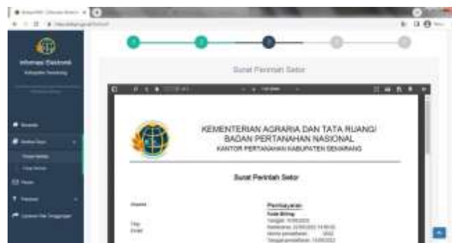
Picture 10. Appearance Page Service website: https://intan.atrbpn.go.id/