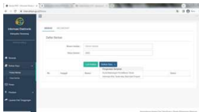
Picture 3. Appearance Page Service website: https://intan.atrbpn.go.id/