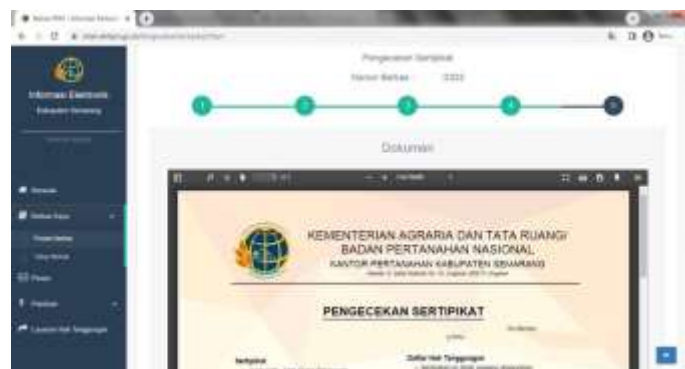
Picture 13. Appearance Page Website services: https://intan.atrbpn.go.id/