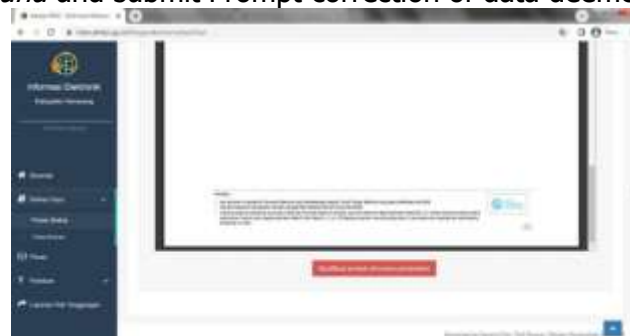
Picture 14. Appearance Page Website services: https://intan.atrbpn.go.id/