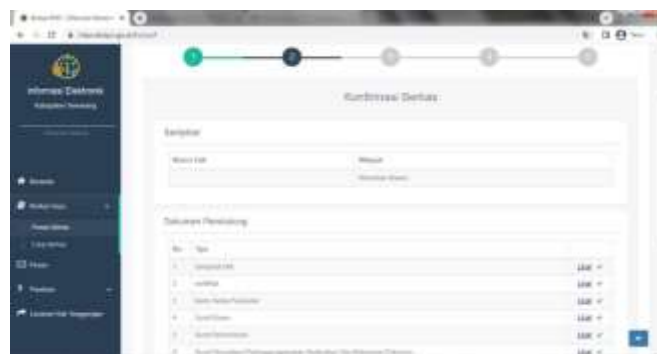
Picture 8. Appearance Page Service website: https://intan.atrbpn.go.id/

After all the files have been uploaded, ensure the correctness of the documents by validating the files. Then wait a few moments for the ownership data to be validated. The validity of the data can be seen by checking the information that has been uploaded to the page. If the file has been successfully validated and data conformity is found, the next step is to click on the data conformity statement and then click continue.