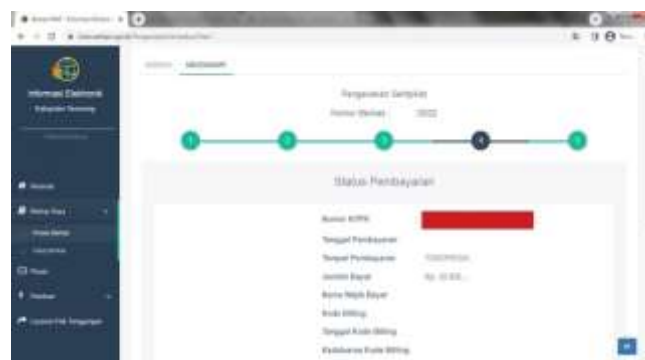
Picture 11. Appearance Page Service website: https://intan.atrbpn.go.id/