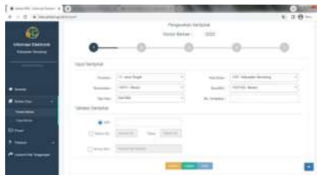
Picture 5. Appearance Page Service website: https://intan.atrbpn.go.id/

So click Save and Upload or Upload Certificate Document Colored