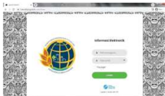
Figure 2. Display Page Service website: https://intan.atrbpn.go.id/

After going to the log in menu, participants can enter the correct username and password to access the National Land Agency (BPN) checking page. Make sure to enter the username and password correctly so that it doesn't repeat itself several times or even block the ownership account.