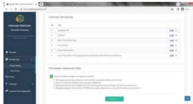
Picture 9. Appearance Page Service website: https://intan.atrbpn.go.id/