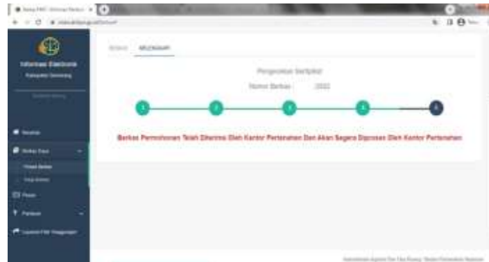
Picture 12. Appearance Page Service website : https://intan.atrbpn.go.id/