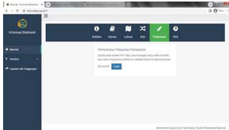
Figure 1. Display Page Service website: https://intan.atrbpn.go.id/

The website page contains log-in notes that must be provided or filled in by the certificate owner. Logging into the website can be done by clicking on the Services page and clicking on the blue log in section. You must log in using a valid ownership account related to the land title certificate you want to check.