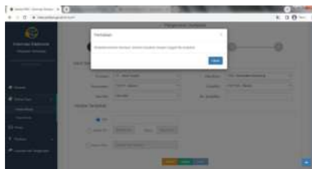
Picture 6. Appearance Page Service website: https://intan.atrbpn.go.id/